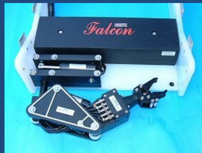
Five Function Manipulator Skid